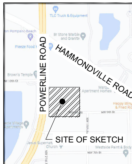
LOCATION MAP: NOT TO SCALE